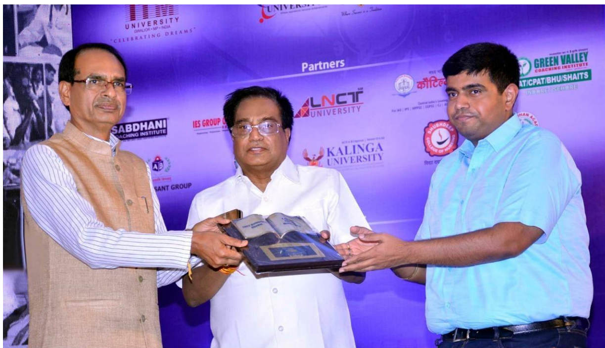
LNCT University awarded as "FASTEST GROWING UNIVERSITY" in Sushiksha Madhya Pradesh by Honb. Chief Minister Shri Shivraj Singh Chouhan.