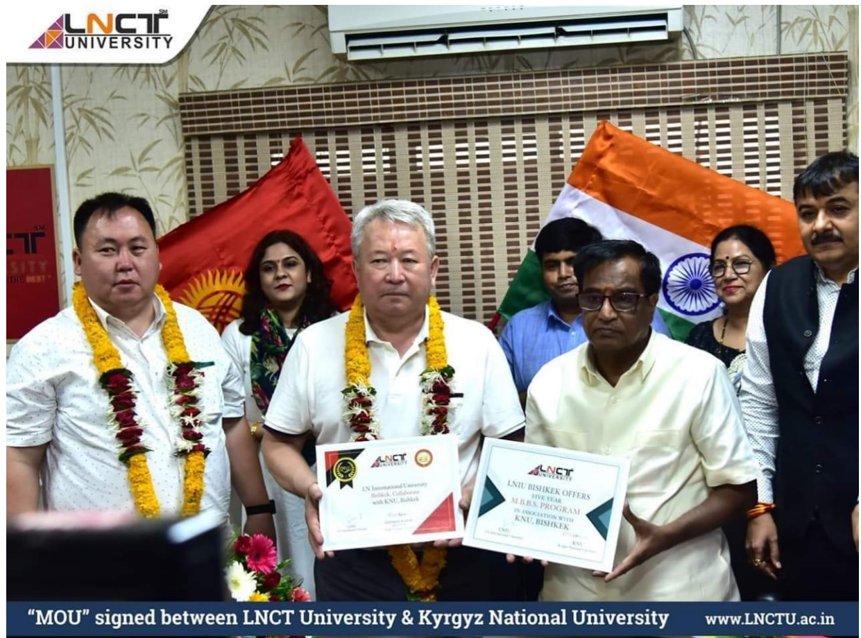
"MOU" signed between LNCT University & Kyrgyz National University